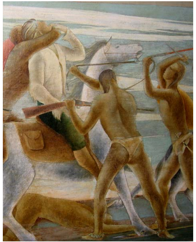
Detail captioned "The Red Man takes the Mochila"