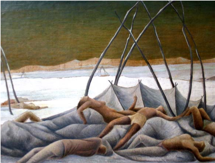
Detail captioned "Death on the Prairie"